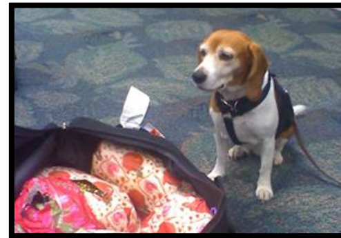
K-9 Hazel, Ft. Lauderdale, FL Pork from Jamaica